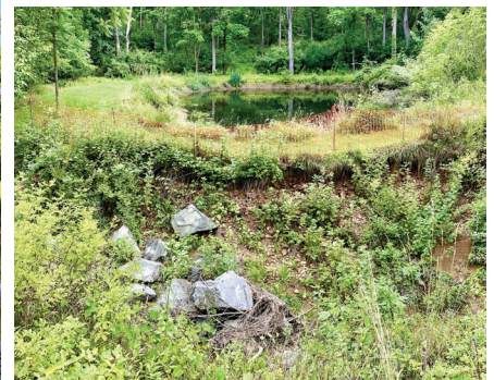
Looking across ditch to pond