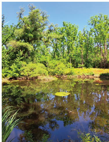
Lorimer small pond

Stay tuned for possible access restrictions during the project.