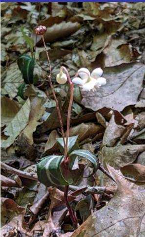
Spotted Wintergreen peeking through the leaf litter in the new property

We are delighted to report that the land donation we previewed in the last edition of Landmarks, the Kendig property, has now been completed! However, the hard work of bringing the property into OLC's portfolio continues. It will be some months before we are able to have an official ribbon-cutting and open the Preserve for public access. Here are some of the things we are working on: